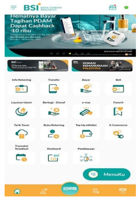
Figure 1. BSI Mobile home menu

Mobile applications have become an indispensable tool in our daily lives, changing the way we manage our finances and conduct banking transactions<sup>19</sup>. In this era, PT Bank Syariah Indonesia Tbk (BSI) introduces its mobile application with the aim of providing more efficient, accessible, and Islamic financial principles-compliant banking services. The analysis of the BSI Mobile application features below will provide deeper insight into the potential services offered.