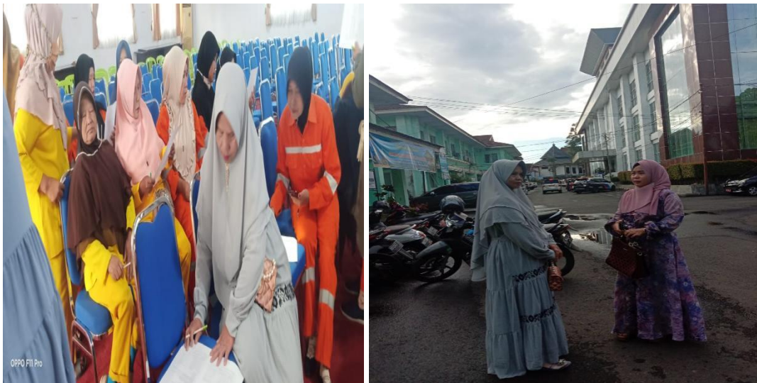
Picture 1 Fill out questionnaires and interviews about religious attitudes and self-regulation

On 4-5 June 2022, the service conducted initial data collection on religious attitudes and self-management of 144 cleaning workers. The assistant gives 10 questions related to religious attitudes and 10 questions about self-regulation. These questions are given in the form of a questionnaire with answers using a Likert scale by providing 5 answer choices.