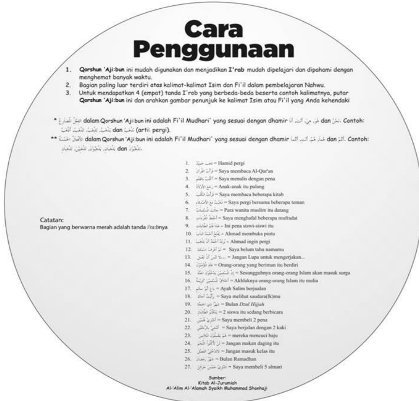
Picture 2. Back View of the Arabic Magic Disc Media Qarshun 'Ajibun